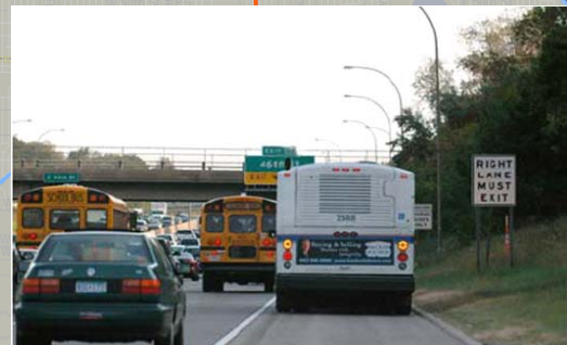
Alternative 8: Managed Lanes - Managed Lane (Segments 1, 2, and 3) - Spot Shoulder Lanes (Segment 4)